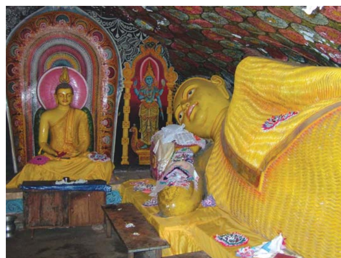
Dambulla Rock Temple

Transfer to the airport for your flight home.