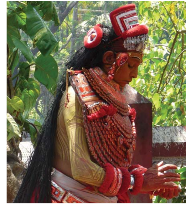
Hindu priest at Kali ceremony