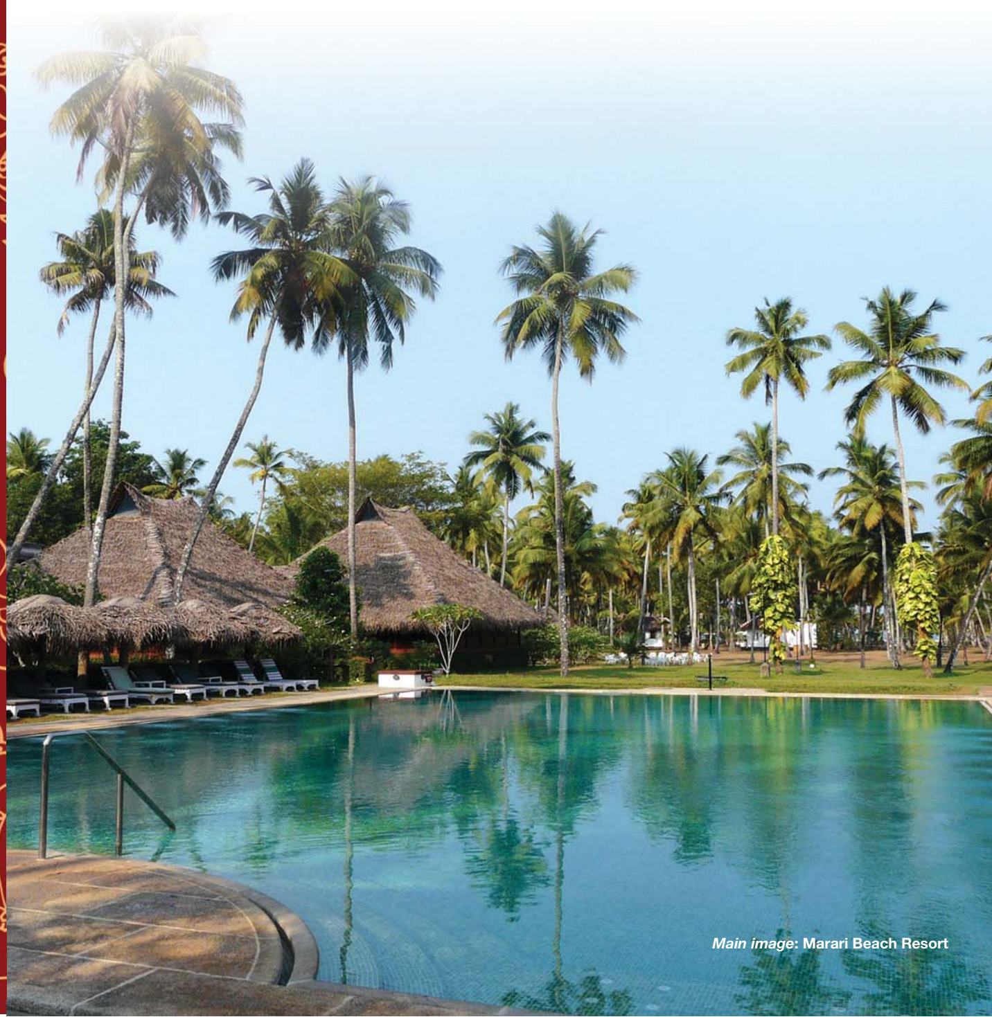
Main image: Marari Beach Resort

In harmony with a rich and colourful history, contemporary Kerala remains true to its cultural heritage. To experience its charms up-close this tour stays in ancestral homes , boutique hotels, a historic club and a refined beach resort. For those who love to get off-the-beaten-track it is an opportunity not to be missed. Discover some of the many hidden aspects of Kerala's cultural, historic and natural wonders.