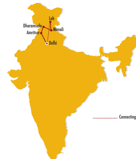
..... Connecting flight