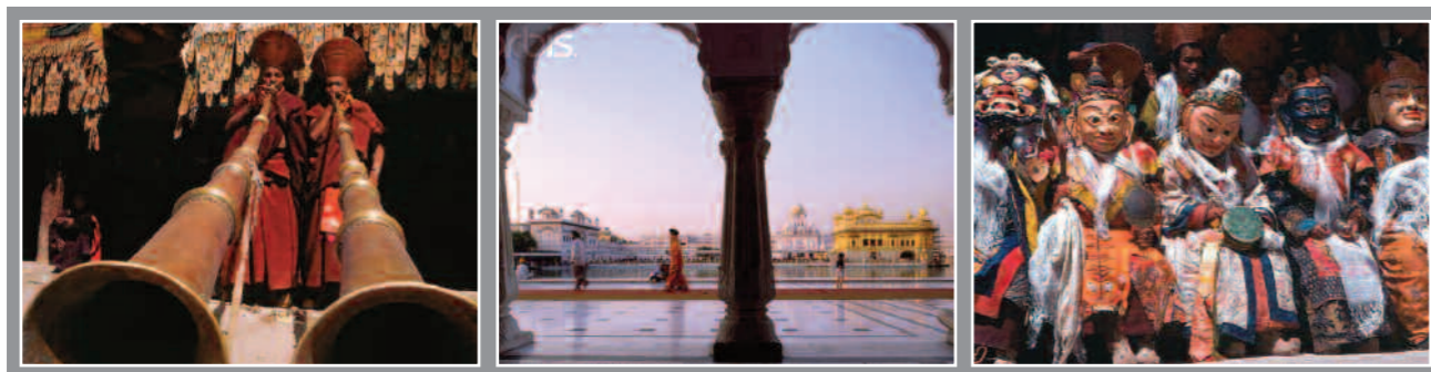
Above from left: Buddhist Monks, Golden Temple, Hemis Festival

Ladakh is a land of awe-inspiring physical features, rugged and spectacular . Bounded by two of the world's mightiest mountain ranges , the Karakoram to the north and the Himalaya to the south, it is both historically and culturally Tibetan. Ancient monasteries and villages continue to preserve their traditional ways of life. The tour also takes you to The Golden Temple in Amritsar , and Dharamsala - abode of the Dalai Lama. The best season to visit is between July and September.